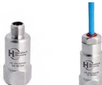
HS-104 Low Power Accelerometer