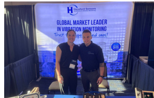
Events & Exhibitions for 2024

It has been a pleasure to attend so many exhibition this year, most recently the 3 days of IMC in Florida.